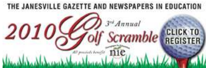
Web ad for awareness & alternate registration