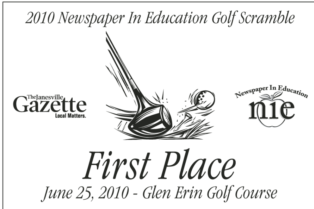
Trophy art for 1 st place plaques